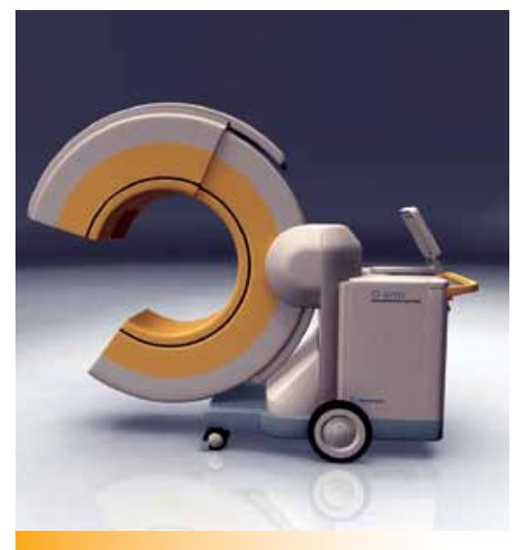
The O-arm Surgical Imaging System from Medtronic is a multi-dimensional, surgical imaging platform that's designed for use in spine, orthopedic, and trauma-related surgeries. Mayfield Plastics manufactured plastic components for the O-ring, as well as the interface between the O-ring and the main cabinet.

Kumar said that Mayfield Plastics offers all the services that its medical device customers need, from product conception to market launch. The company's